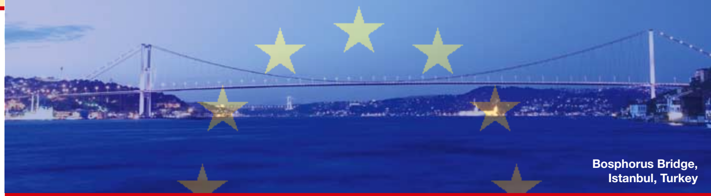
Bosphorus Bridge, Istanbul, Turkey

Key contributors are expected through various experts, associations, initiatives, societies, networks at the local to international level (e.g. BMBF-IB, BVMD, COPORE, DAAD, EAEC, EMA, EMSA, EMSC, EPMA, German-Turkish Medical Society, Global Marshall Plan, HRK, MoHProf, RedCross/RedCrescent, Tübitak, WHO, UNESCO). Last, but not the least, important contributions are guaranteed by European Community offices and General Directorate representatives (e.g. EACEA, GD EduC and GD SANCO).