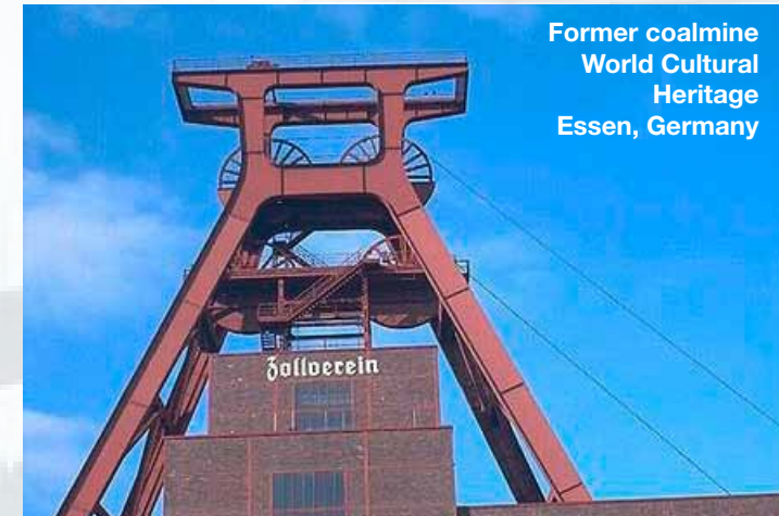
Former coalmine World Cultural Heritage Essen, Germany